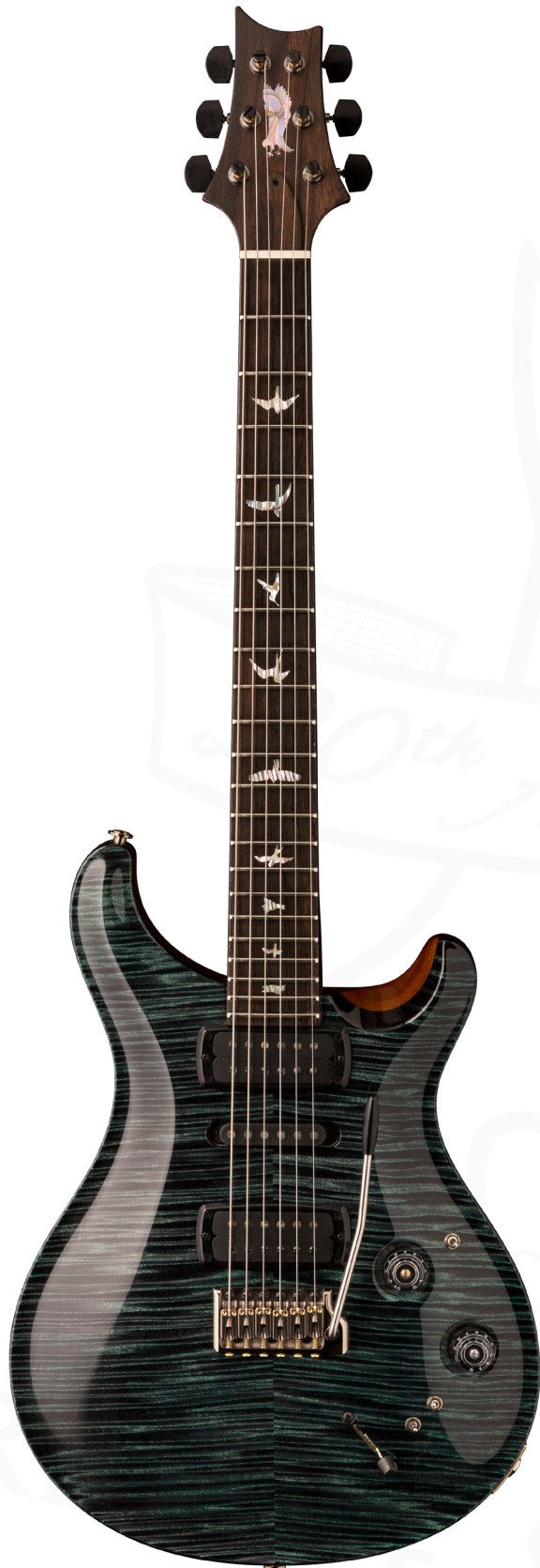
Shown in Slate